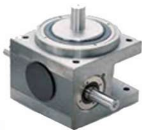
PIS (precision cam curve equation indexing equipment)