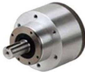
BR (standard concentric axis speed reducer)