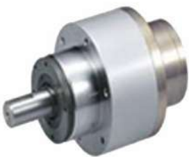
BBR (high reduction ratio speed reducer)