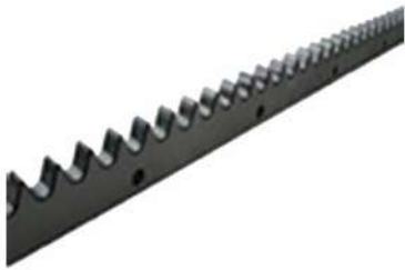
CRK (cam rack)

We, Kamo Seiko Corporation, develop, manufacture and sell the ball type speed reducer. TCG (Runner & Ring). Pearldex, etc Which are unrivaled, novel and useful machine elements (patented products). Under the highly competitive circumstances, we will contribute to the industries with our originality and ingenuity, while enjoying unvariable support and encouragements, so as to earnestly make a progress with the societal development in mind.