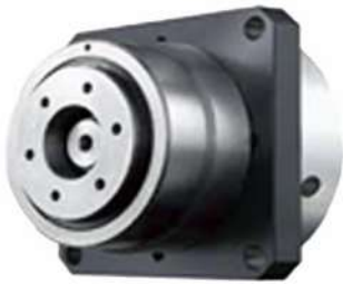
JFR (thin concentric axis speed reducer)