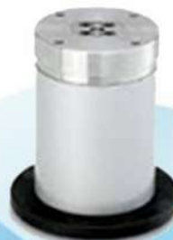
MT (intermittent pneumatic indexing equipment)