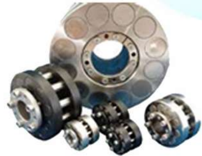
RPN (roller pinion)