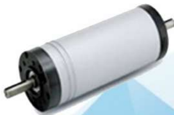
MD (intermittent pneumatic indexing equipment)