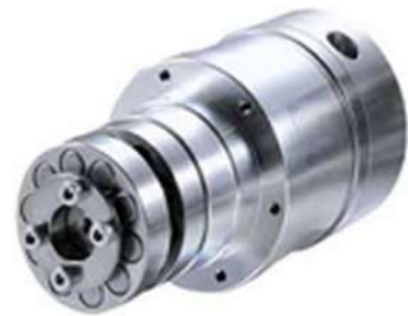
SFP (TCG for speed reducer)