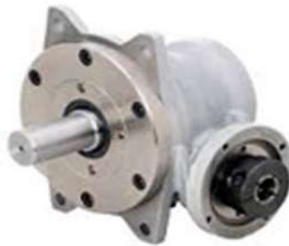
CBR (orthogonal axis speed reducer)