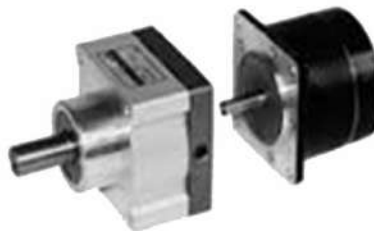
BRA (corner speed reducer)