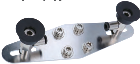
Model ex.) VPRHT-100-M5-2-VPMB25RN4J