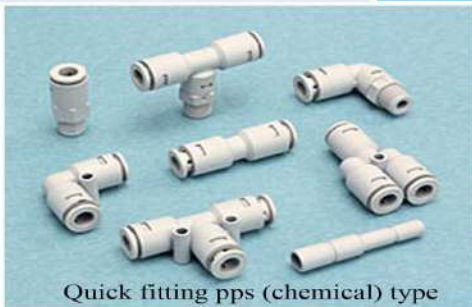
Quick fitting pps (chemical) type