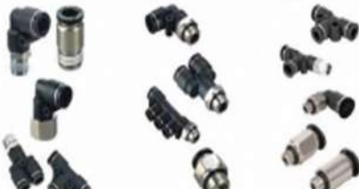
PT thread G thread Mini fitting