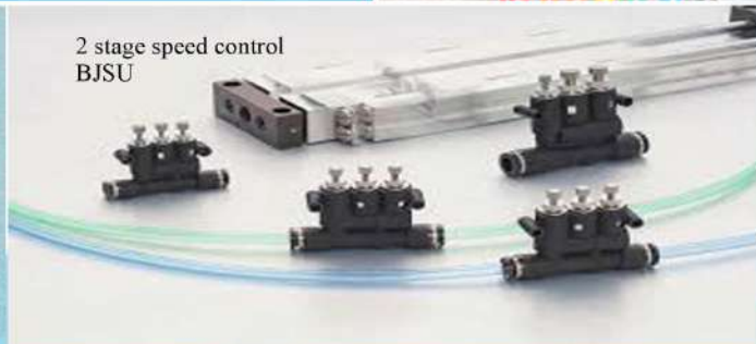
2 stage speed control BJSU