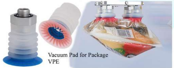
Vacuum Pad for Package VPE