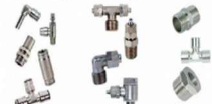
Metal push in fitting Rapid fitting for plastic tube Pipe fitting