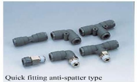
Quick fitting anti-spatter type