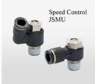
Speed Control JSMU