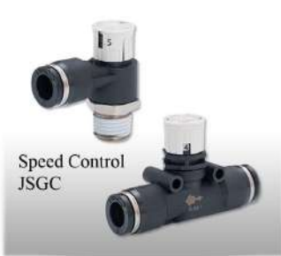
Speed Control JSGC

NIHON PISCO supplies wide variety of pneumatic equipment with a balance of quality and cost to meet with customer's demand. At same time, we achieve quick and sure delivery by advance delivery system. Including : Fitting, Control, Valve, Vacuum, Actuator, Tube, Plarailchain, Robot Part.