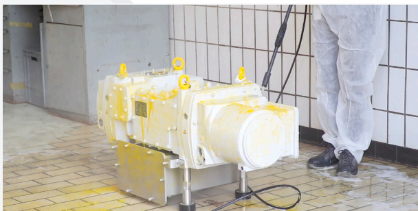
DRYVAC DV 650 FP-r designed for wash-down environment

Have a look at our dry compressing, robust vacuum pumps DRYVAC DV 650. We show you a robustness test by the ingressing of 10 liter of water: